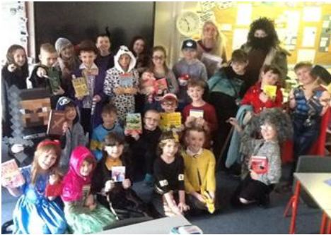
3: Kingfisher class shared their favourite books