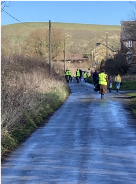
Long Bredy Spring Clean

Doors will open for the next Come Along Inn on Friday April 15th at 5.30 and close at 9.00pm . Enjoy a drink..alcoholic or soft...and a natter with friends in the unique surroundings of our village hall.