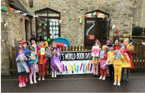
1: Wagtails enjoyed dressing up for World Book Day