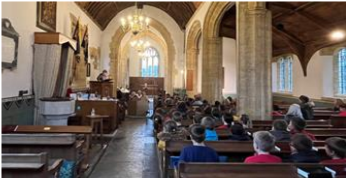
The whole school enjoyed the return of Open the Book which took place in the church