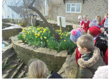
2: Robins class enjoyed a walk around the village, looking for signs of spring