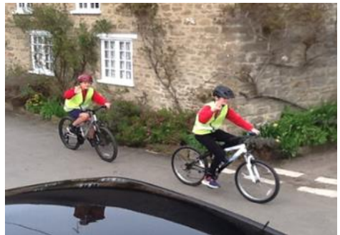
4: Year 6 pupils enjoying bikeability